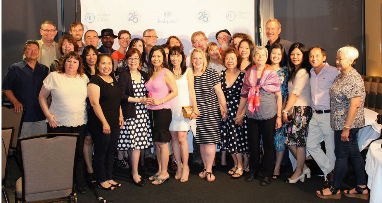
To the point! Successful positioning